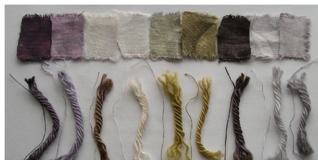
Cotton fabric (above) and cotton and merino wool yarn (below) coloured with gold nanoparticles

The resulting products contain only the pure fibre and pure gold, thereby linking the inherent high prestige of gold with quality and high value fashion.