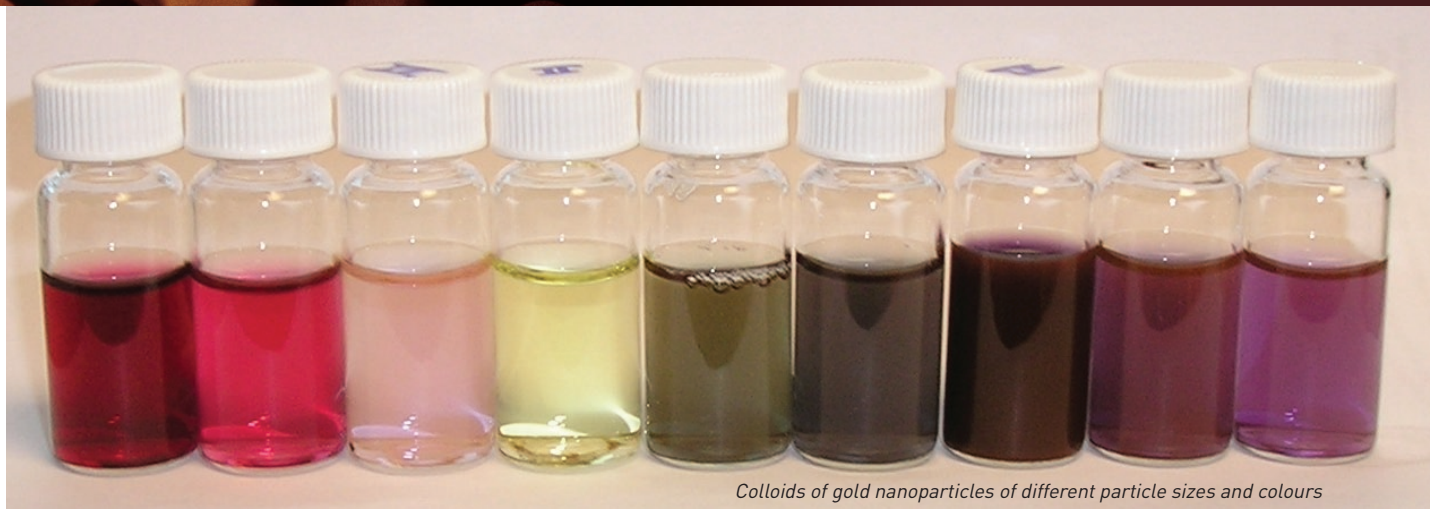
Colloids of gold nanoparticles of different particle sizes and colours